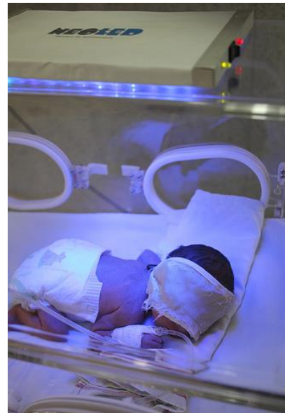
NEO Led equipment designed by Ingenimed, used for neonatal jaundice treatment. (Cusco, 2011)